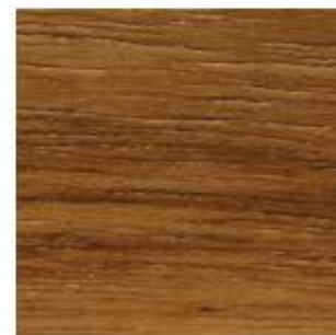
T | Burma Teak