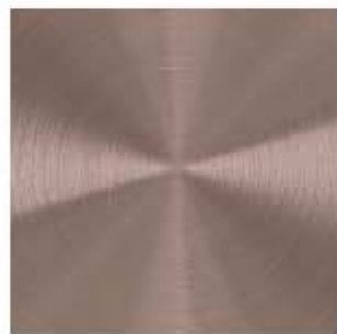
Z | Bronze