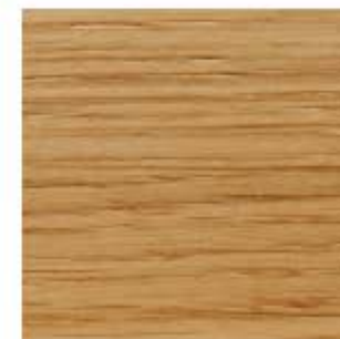
O | Oak