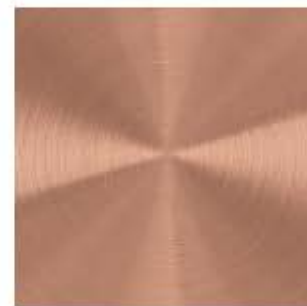
P | Copper