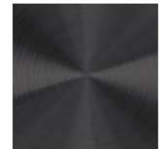
KD | Black Diamond