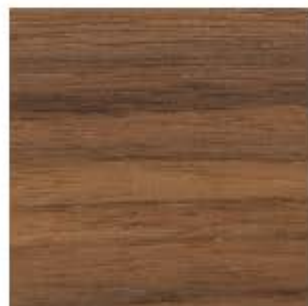
N | Canaletto Walnut