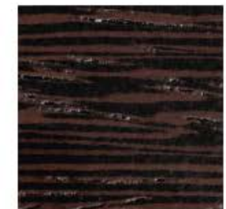
WE | Wenge