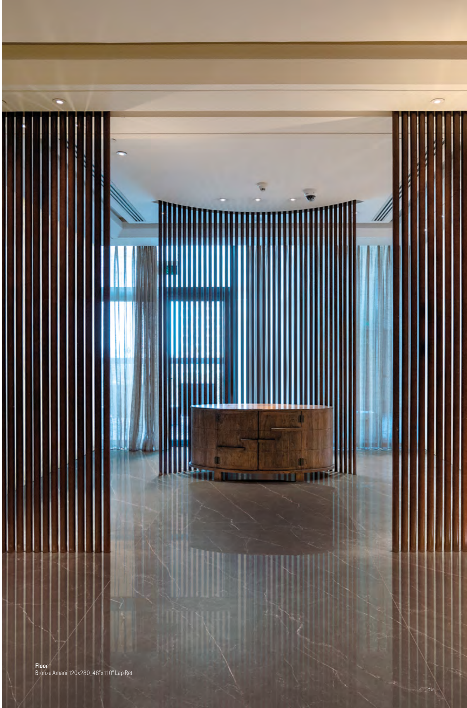
Floor Bronze Amani 120x280_48"x110" Lap Ret